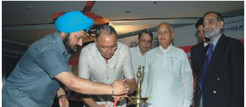
Gen. (Retd.) S.F. Rodrigues, Governor of Punjab & Administrator Chandigarh inaugurating e-revolution