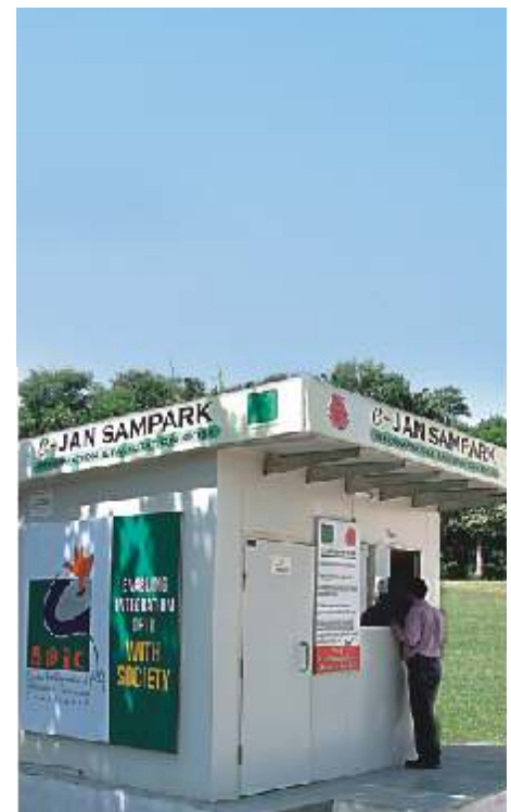
A citizen availing e-Jan Sampark Services

These services are provided free of cost except when the citizen needs any print out, the same is available at a nominal cost per page of print out. E-Jan Sampark services have been simultaneously launched from the Sampark Centres situated in Sector 10, Sector 15, Sector 18, Sector 23, Sector 43, Sector 47 Industrial Area and Mani Majra. The other sites in Phase I which have been identified for setting up of e-Jan Sampark Services are Sector 9, Sector 11, Sector 17, Sector 22, Sector 32, Sector 35, Sector 38, Sector 40 and Sector 45. These services will also be available in all the UT villages from the Gram Sampark Centres, which are likely to be launched in October 2006.