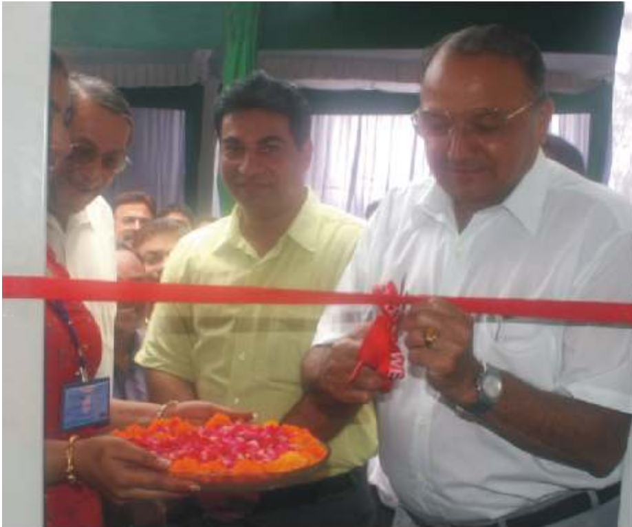
Gen. (Retd.) S.F. Rodrigues, Governor of Punjab & Administrator Chandigarh inaugurating 1st e-Jan Sampark Centre

e-JAN SAMPARK INFORMATION & FACILITATOR KIOSK