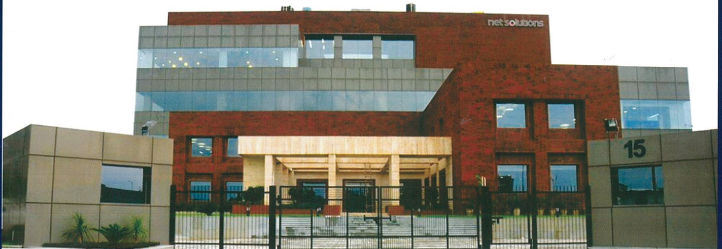
Present campus of Net Solutions at RGCTP IT Park, Chandigarh