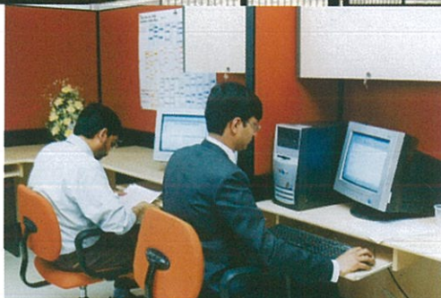
Net Solutions starting their journey from SPIC in 2002