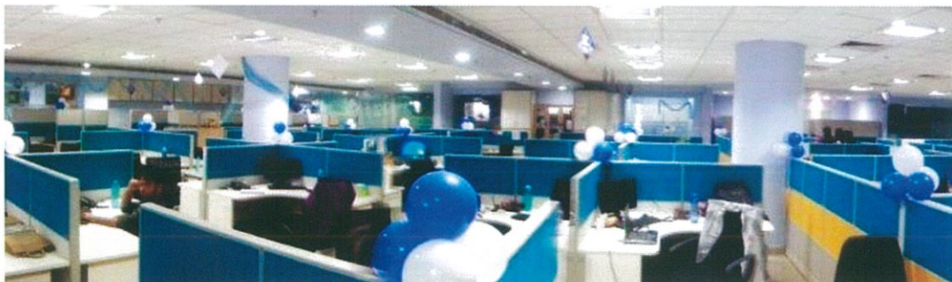
Present office of Winshuttle