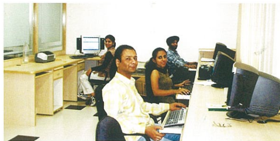
Winshuttle starting their journey from SPIC in 2005